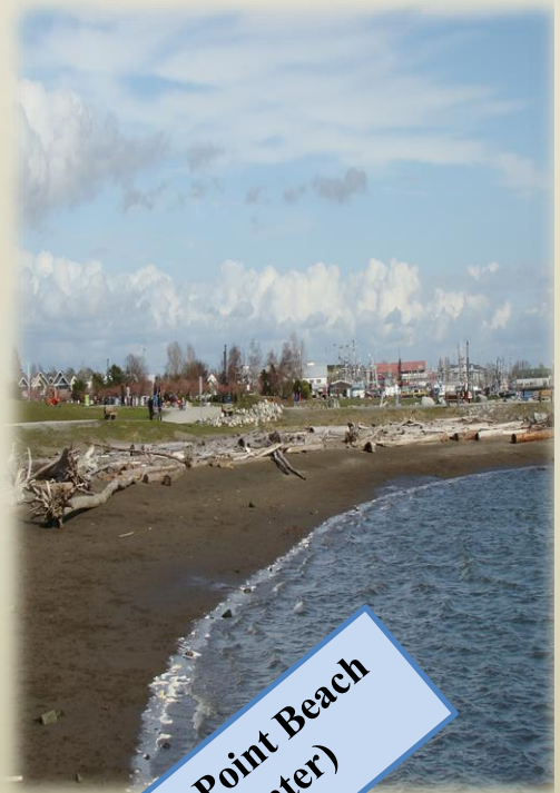
Garry Point Beach (in the winter)