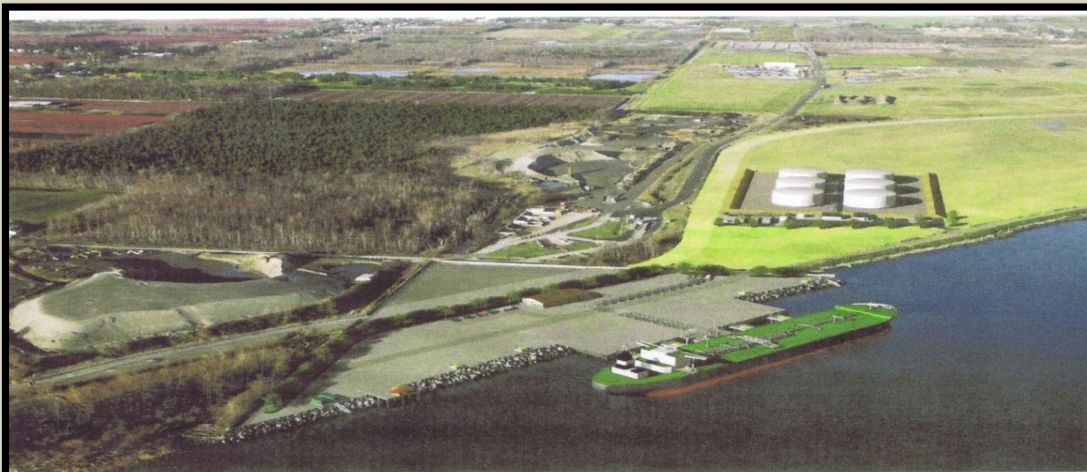
Artist portrayal of the VAFFC jet fuel unloading terminal and tank farm on the north shoreline of the Fraser River in Richmond, B.C. The reader is looking north across east Richmond, This site is upstream of the Massey Tunnel and the nearby SilverCity, Watermania, Ice Centre and residential complexes in Richmond.

The river channels keep changing in that millions of tonnes of sediment are transported into this area each year and extensive dredging is required to keep the channels navigable. The George Massey Tunnel is also a shipping bottleneck in that it is the rivers most shallow point and most large heavy ships cannot pass over it except at high tide and at times with reduced cargo loads as is required for VAFFC jet fuel tankers.