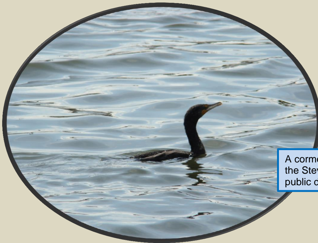
A cormorant fishing In the Steveston Harbour public dock area..

Should a jet fuel dock facility, tank farm and tankers and barges of jet fuel be allowed into the Fraser river, future generation will wonder who and how was this decision made especially in what should have been an era of knowledge and precautionary decision making.